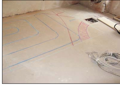
Figure 2. Position of heater tubes was marked by blue chalk, and red chalk was used for cables.