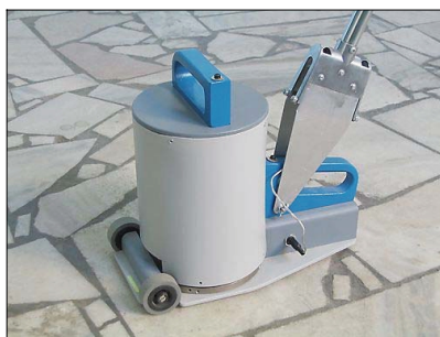
Figure 1. RASCAN-4/2000 radar head.

There was apprehension that the plastic pipes could be invisible on the background of metal mesh because of plastic has lower reflectivity towards environment (cement screed) than metal. It is worth noticing that an object contrast on holographic radar image depends of its reflectivity and phase shift that is a function of the distance to the object. For extended objects radiation polarization has also great influence on resulting contrast.